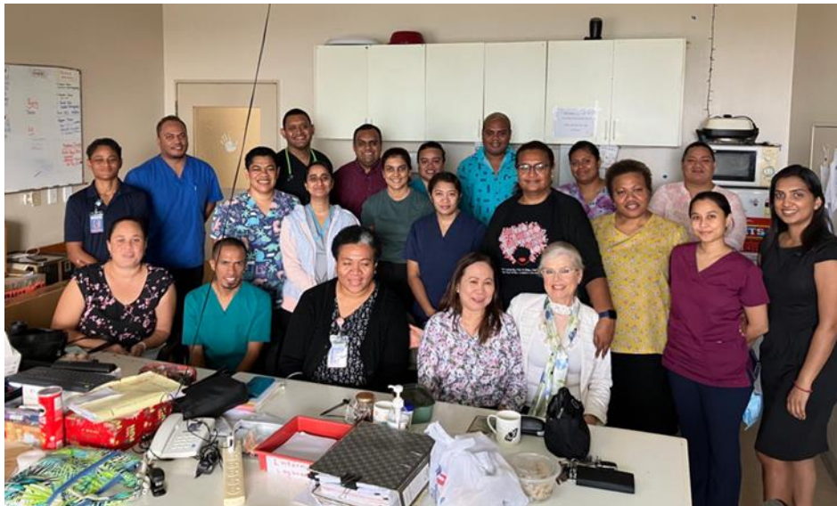
Paediatric colleagues at the Colonial War Memorial Hospital, Suva, Fiji.

Meetings included a visit to the Frank Hilton Organisation who care for disabled children in Fiji and the Sai Sanjeevani Children's Hospital.