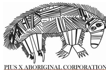
PIUS X ABORIGINAL CORPORATION

The amazing team at PIUS X Aboriginal Medical Service, Moree.